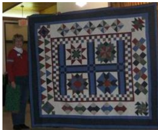
What a beautiful quilt!