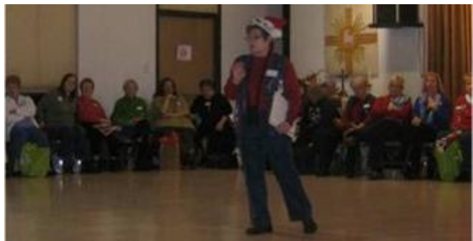
And the gifts go round and round ....