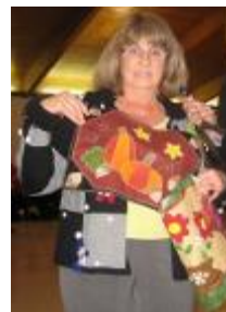
Dottie's been busy!