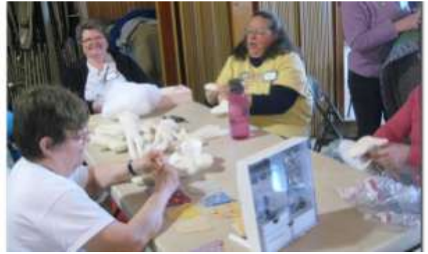
Is this the stuffing table?