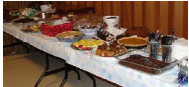
Some of the lovely food at the Christmas meeting.