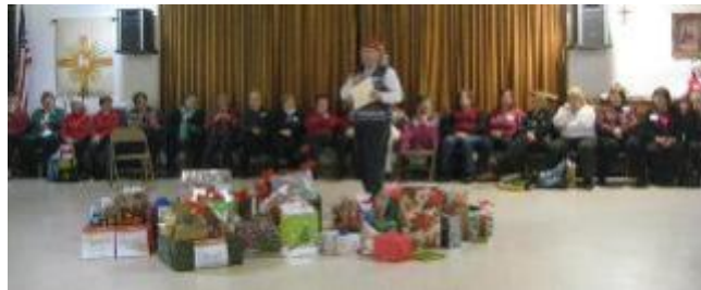
Gift exchange at the December meeting.

And let's Turn a New Leaf With the Smell of New Rain. Let's Forget Past Mistakes Making Amends for This Year. Sending You These Greetings To Bring you Hope and Cheer. Happy New Year! Author Unknown