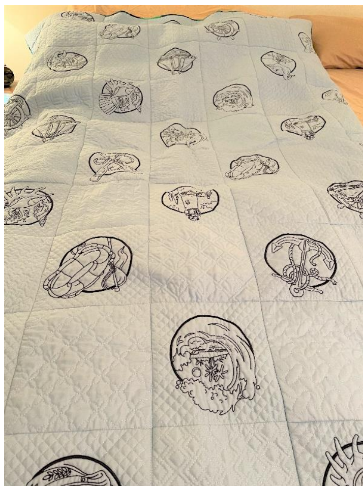
Dara Diner - The nautical quilt is machine embroidered blocks (AnitaGoodDesign and Designs by JUJU)