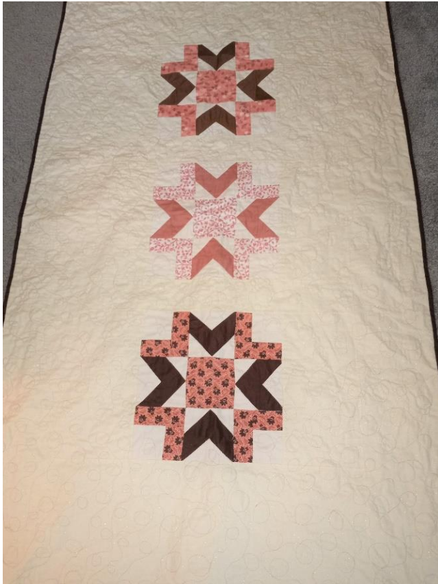
Linda Jarosz – Window covering to block cold air