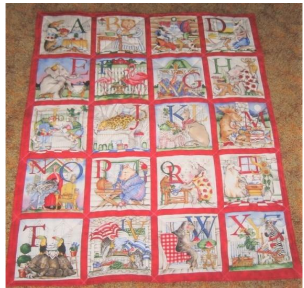
Ethel Hutchinson – Comfort Quilts