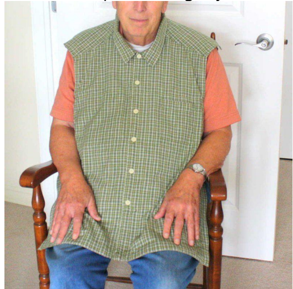
Example of a dignity bib