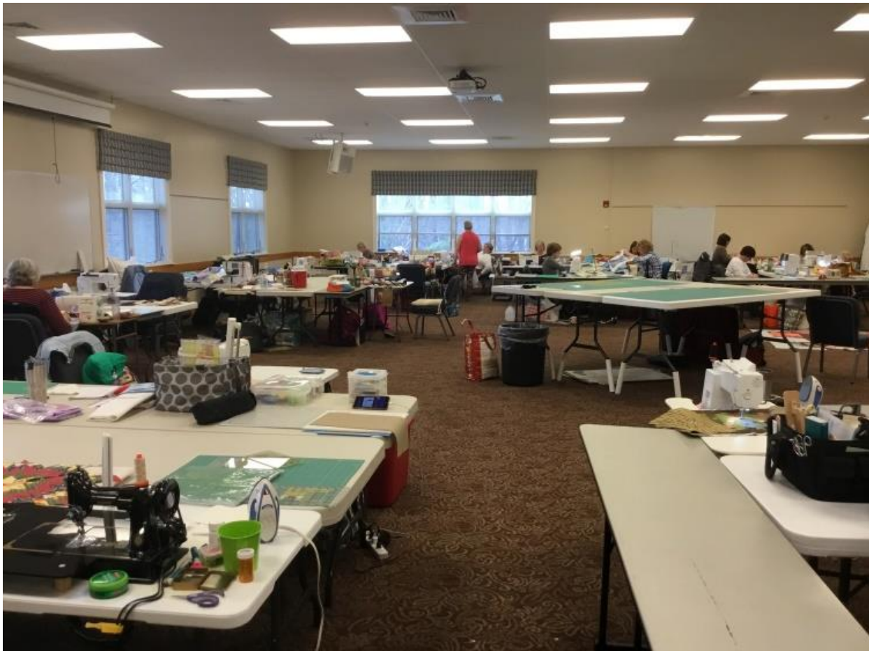
Sewing room from our 2018 Black Rock Retreat