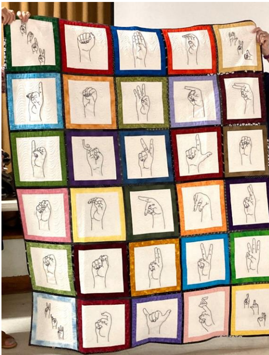
American Sign Language