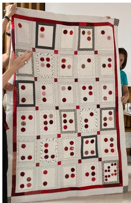
Alphabet in Braille made with yo-yos