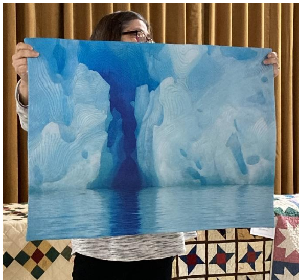
Becky Weiland's project utilized a photo from Iceland reproduced at Spoonflower.