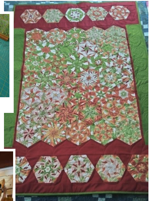
Laura Chaplar One Block Wonder