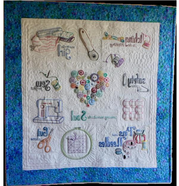
Deb Graves' Wall Hanging