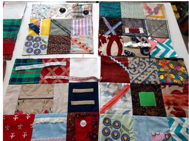
and Fidget Quilts from April Meeting