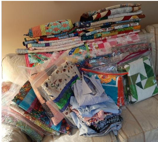
Comfort Quilts and Dignity Bibs