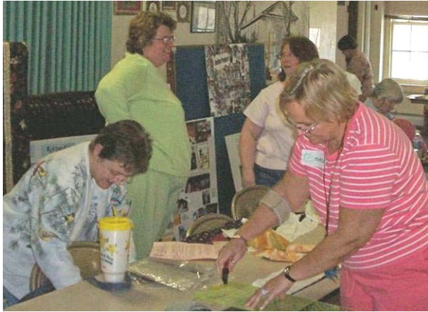
Braided quilt workshop