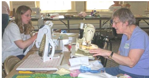
Bullwinkles at Braided quilt workshop

Mix together all the dry ingredients (while raisins are boiling on stove). Add oil, cold water, and the raisins (and the water they were boiled in). Mix altogether. Bake at 350 degrees for 45 minutes in 9" by 13" baking pan.