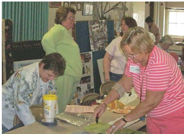
Braided quilt workshop