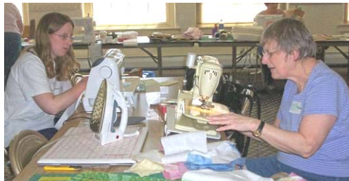
Bullwinkles at Braided quilt workshop

Mix together all the dry ingredients (while raisins are boiling on stove). Add oil, cold water, and the raisins (and the water they were boiled in). Mix altogether. Bake at 350 degrees for 45 minutes in 9" by 13" baking pan.